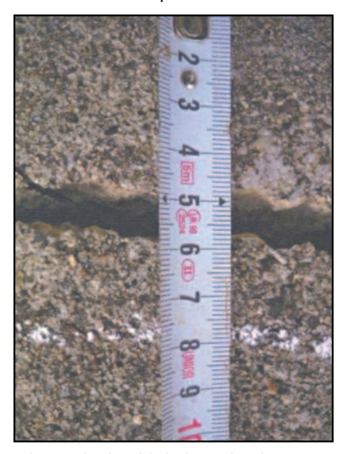
Figure 3: Deformed position, the breakages in the third phase loads