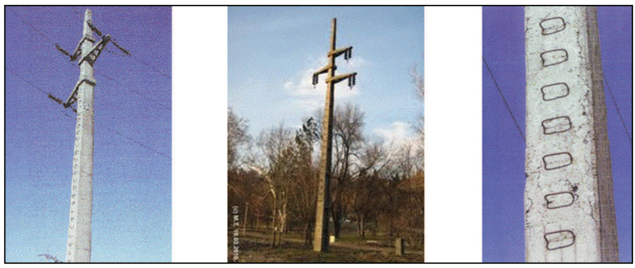
Figure 1: Condition of poles