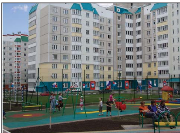
Figure 1: Urban residential district view and infrastructure