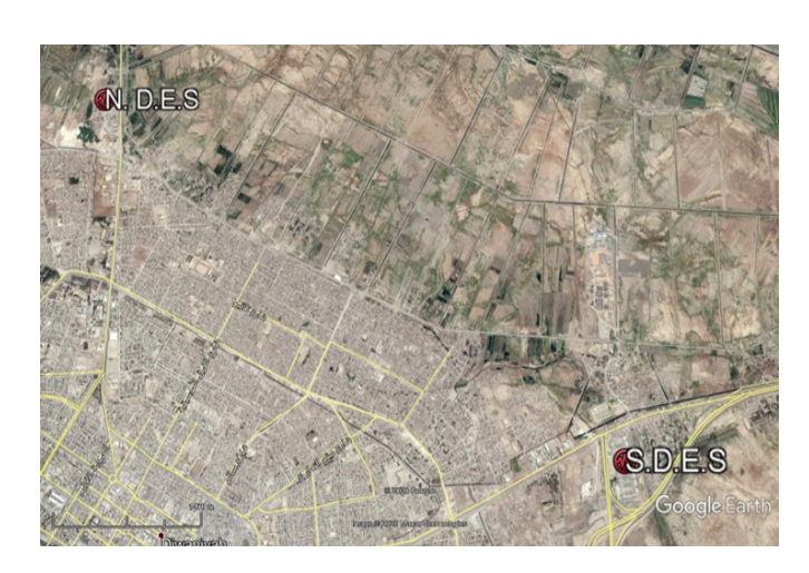
Figure 1: Location of the two stations concerning the city center of Al Diwaniyah (S.D.E.S: South Al Diwaniyah Power Station; N.D.E.S: North Al Diwaniyah Power Station)

These two stations are two diesel stations located to the north and south of Al Diwaniya were established in 2012 and built by the Korean company STX at the cost of 232 million dollars and with a completion period of six months. Each station has 48 engines, and the design capacity is approximately 200 MW for each one. The size of each engine is 4,061 kW, and each engine has four strokes (internal combustion). These engines work on two types of fuel (heavy fuel and diesel) at a consumption rate of 250 liters of fuel per megawatt-hour (100-101). At a time, Iraq was suffering from a severe crisis in the production of electrical energy; these two stations were a temporary and quick solution to solve this crisis. We notice an absence of a study of the environmental impact of establishing the two stations, as the stations are located to the south and north of Al Diwaniyah (Al- Qadisiyah Provincial Center) shown in Fig. 1 [14]-[15].