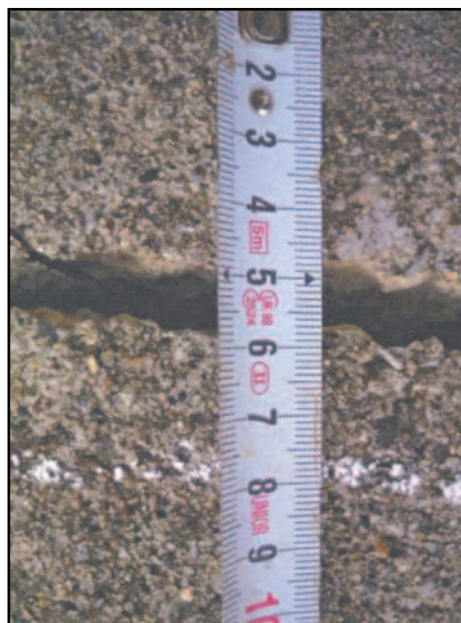
Figure 3: Deformed position, the breakages in the third phase loads