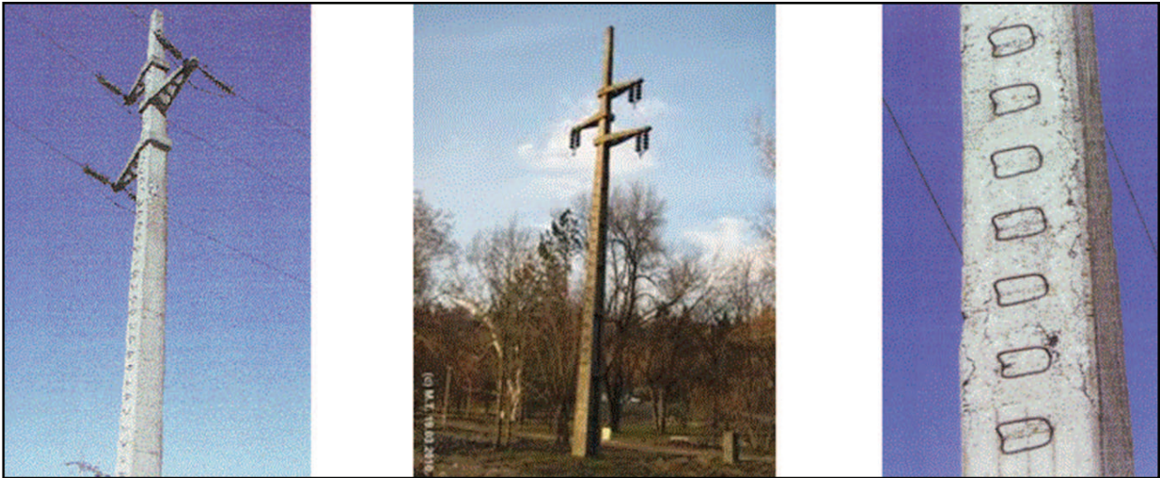
Figure 1: Condition of poles