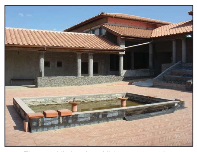
Figure 1. Viminacium, Visitorscenter atrium

The Rustic villa is a new building at the archeological site. This building or Viminacijum center has a multiple function, in commercial and scientific sense. It is a component of the complex, beside the roman settlement and military camp. The Viminacijum center is imagined as a place which enable gathering of business and intellectual elite in an ambient of old roman city and military camp. In other days it will be open to visitors and tourists. It means that the Center will have several levels: scientific and research, education, marketing, all in function to promote the Center as an attractive scientific and tourist loca-