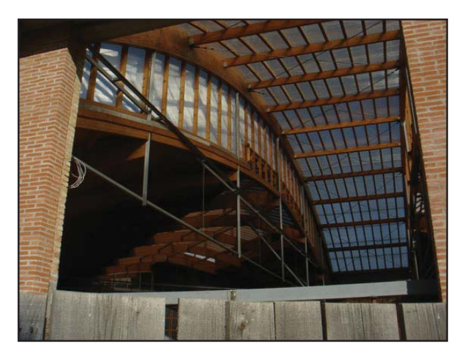
Figure 4. Sirmijum, Visitors center construction