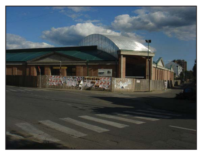
Figure 3. Sirmijum, Visitors center

In last several years a particular attention is paid to organization and presentation of a part of Imperial Palace. The remnants of the palace are covered by a permanent structure, opened for visitors in the 2009. This new building, beside the protection, has a function of a Visitors' center also. The center include a gallery for selling souvenirs and publications, wardrobe, coffee bar, official block for personal, depots and pantry, as well the rooms for custodians. Construction of the building is realized by laminated wood. Above archeological remnants there is a light steel construction, with trails for visitors, enabling full view of the site in the whole [7] (Figure 3 and Figure 4).