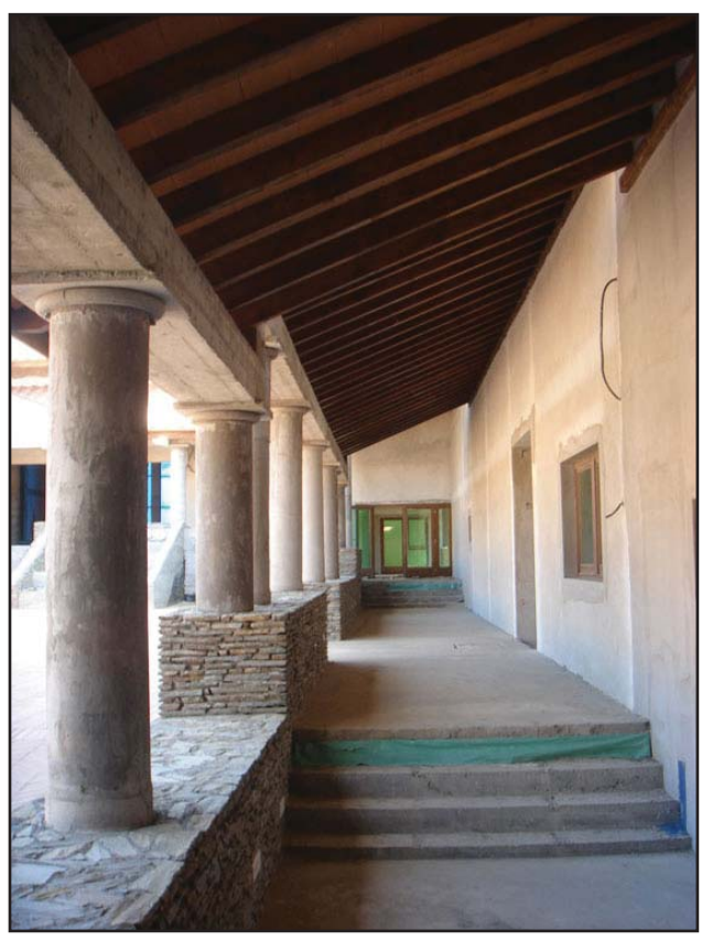
Figure 2. Viminacium, Visitorscenter atrium

tion. It will be organized around seven atriums. It will have laboratories for scientific investigations, accommodation capacities and necessary economic and service part (Figure 1 and Figure 2).