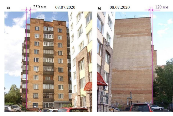
Figure 2: The size of the tilt: a) a residential building on Zelenko street (Kursk); b) a residential building on Mirnaya street (Kursk)

Upper Cretaceous deposits are represented by weathered and dense marls, clay thrusts, partially crushed; paleogene deposits are represented by clays. Modern deposits (the zone of active interaction of the building with the ground base) are represented by middle-upper Quaternary deposits (Figure 4). Aeolian-deluvial loams and sandy loams of various consistencies are combined into a single complex with cover formations. The cover formations are represented by loess-like loams (less often loams) of solid and semi-solid consistency. Loess-like loams have subsidence properties, the thickness of the subsidence is from 4-7 meters.