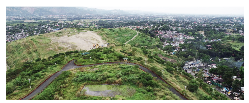
Figure 2: Payatas Controlled Disposal Facility, Quezon City, Philippines