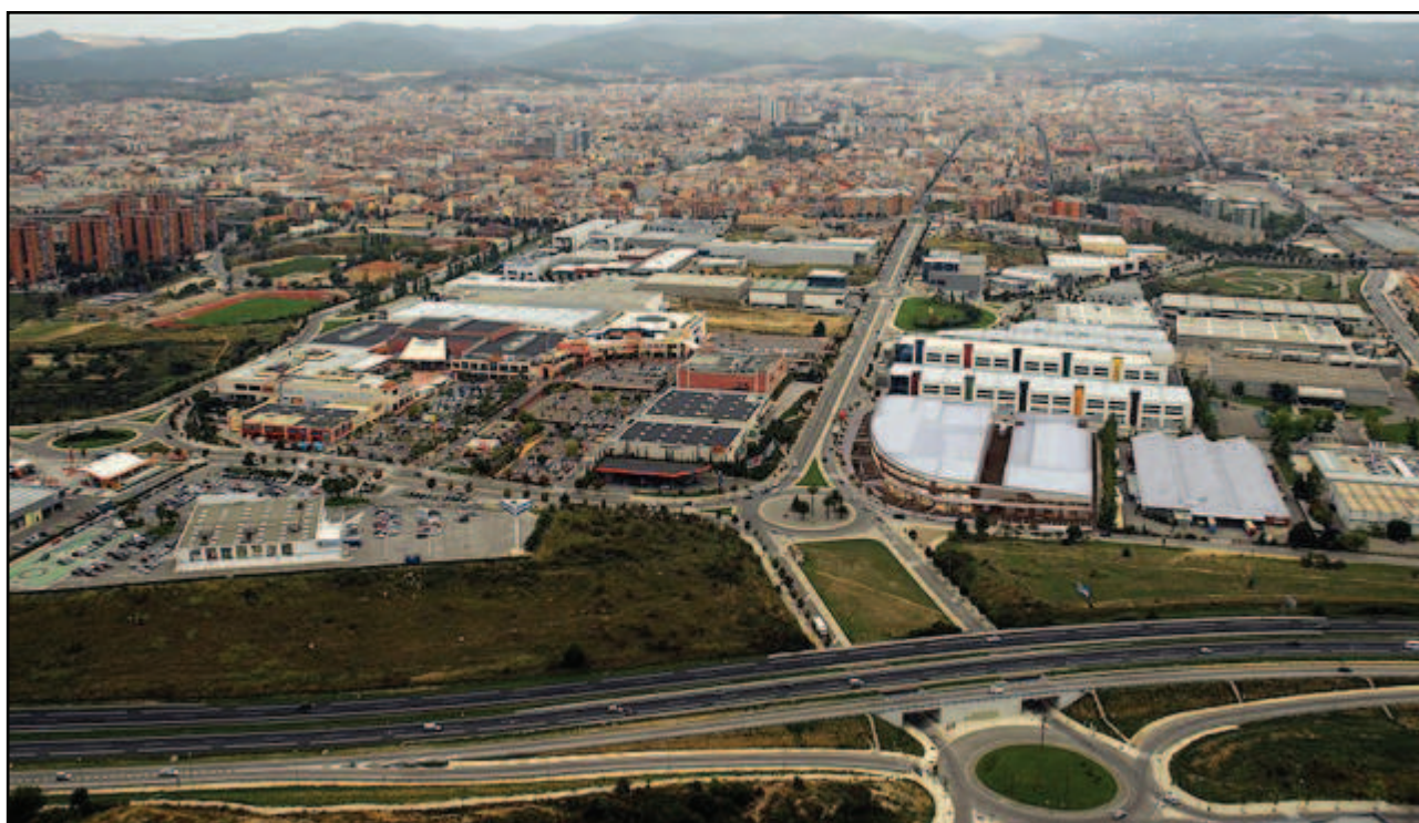
Figure 1: Industrial area Santa Margarida II

vices or finances. In the west, there is a trend of industries going back to towns in a new manner: new types of activities development, new technologies, including digital design, engineering design, testing and manufacturing, backed by internal professional services and innovative technologies. It is referred to a new industry requiring appropriate areas. It is highly important to consider in detail and evaluate which possibilities were open for regional economies by globalization, and whether the concept of noisy and polluting industry isolated from cities has passed away. . Industrial area Santa Margarida II with the area of 55 hectares in the city of Terrasa, Spain. Mixed-use «area» of manufacturing and commercial activities (incl. huge leisure center «Par Buyers») tending to be considered as completely integrated into the city structure. However, it may be perceived being far beyond an ideal one.