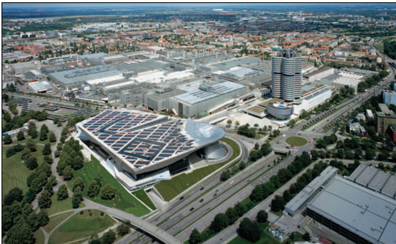
Figure 2: Multi-functional distribution and exhibition center BMW Welt

Munich, Germany. It is located very close to the head-quarters of the company, Olympic park, industrial area and residential districts with underground (subway) lines.