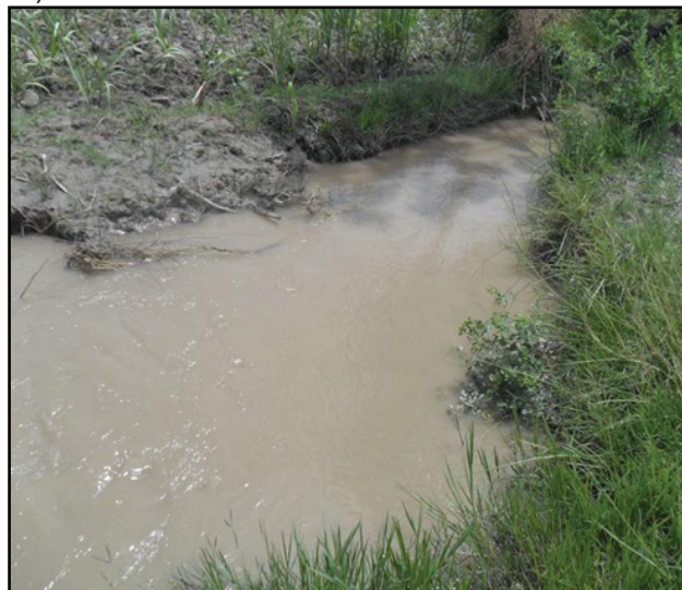
Figure 2: Views of two different unlined watercourses in Village Haji Ali Nawaz Khoso, Noorpur, Sindh

The total loss due to silting in reservoirs is about 13.20 MAF. Table 2, shows the list of main reservoirs of Pakistan and their capacity to store water (Fateh ullah Khan Gandapur 2010).